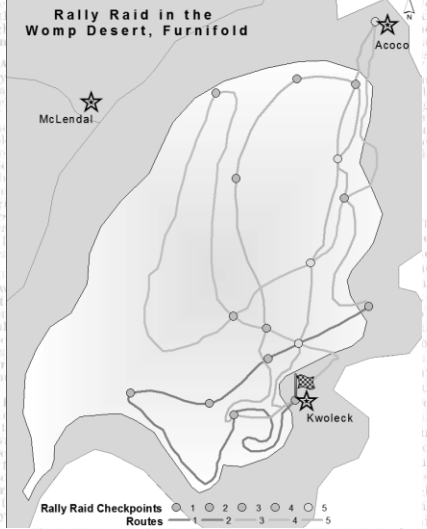
Rally Raid in the Womp Desert, Furnifold

THE LATE LORD MAYOR.— The following vote of thanks to the late Lord Mayor was presented at the Court of Aldermen on Tuesday. "That the cordial thanks of this Court be presented to the Right Hon. David Salomon, late Lord Mayor of this City, for the courtesy and ability with which he has presided over the deliberations of this Court; for the efficient manner in which he has discharged the various duties of chief magistrate; and for the liberal and judicious manner in which he has not only visited the dignity which he holds, but also the right of God will be."